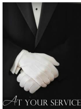
Principal, The British Butler Institute